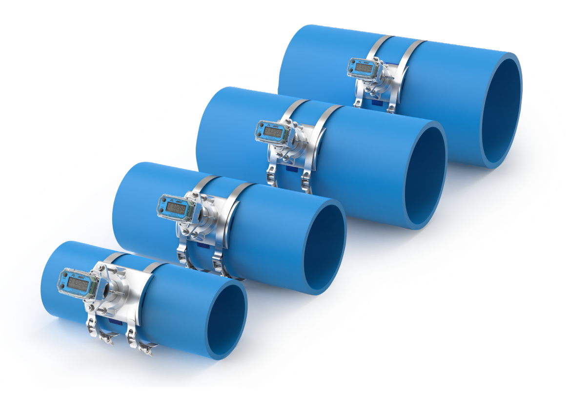
SADDLE FAMILY LINE-UP (Shown on pipe. Pipe not included.)