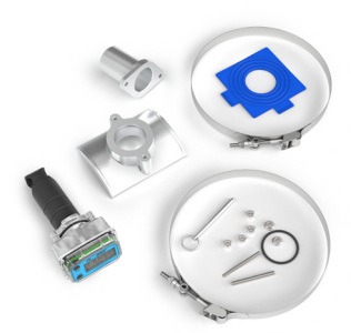
Representation of contents